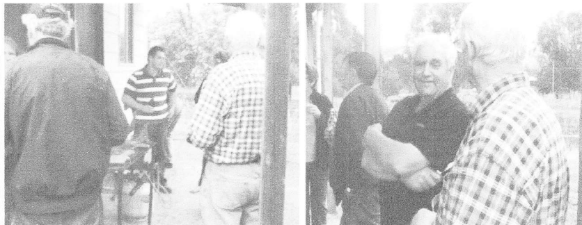
The Landcare BBQ